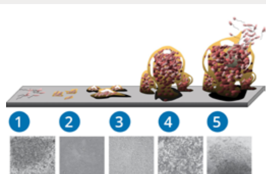
Five stages of biofilm formation