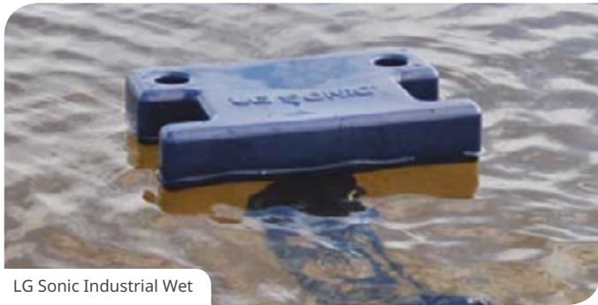
LG Sonic Industrial Wet