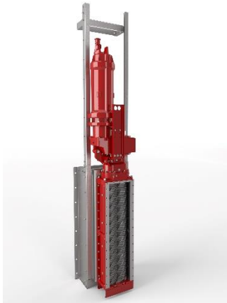
Image 1: The XRipper XRC is particularly suitable for open channels and shafts.