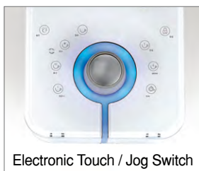
Electronic Touch / Jog Switch