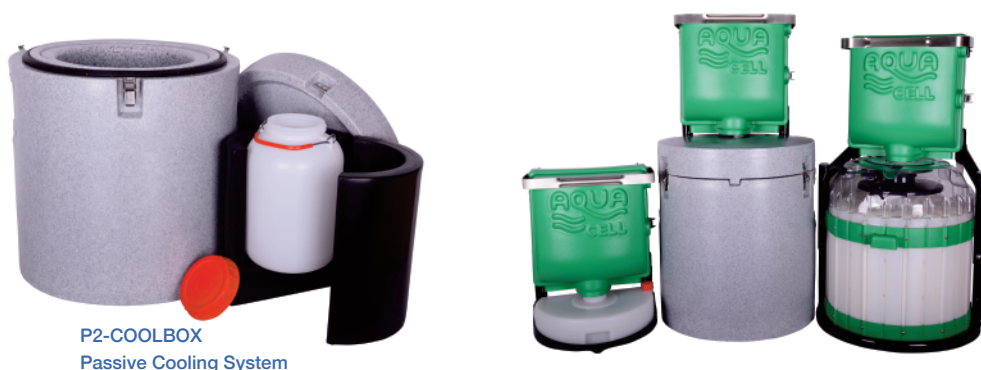
P2-COOLBOX Passive Cooling System

Aquamatic Ltd Soapstone Way, Irlam, Manchester M44 6GP, UK t: +44 (0) 161 777 6607 f: +44 (0) 161 777 6617 sales@aquamaticsamplers.com www.aquamaticsamplers.com