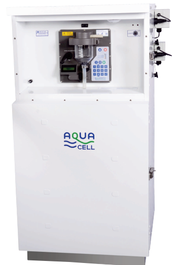
Portable, Wall and Floor-mounted Samplers all feature the Aquacell Sampling Module

Aquamatic Ltd Soapstone Way, Irlam, Manchester M44 6GP, UK t: +44 (0) 161 777 6607, sales@aquamaticsamplers.com www.aquamaticsamplers.com