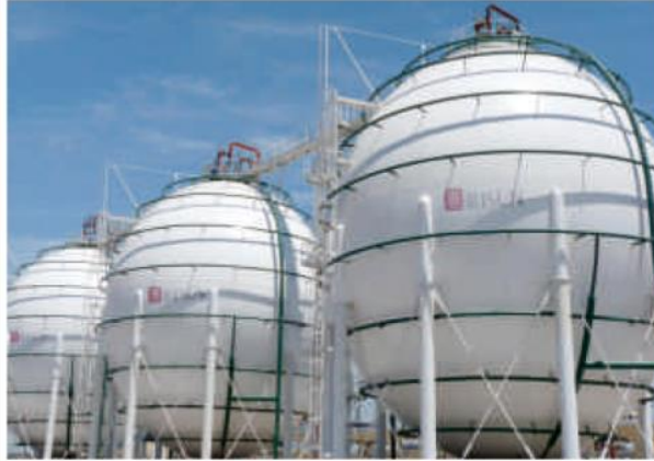
▲ Chemical Industry