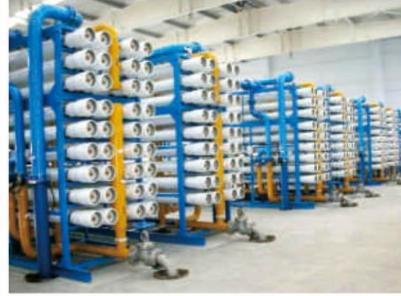
▲ Water Reclamation Plant