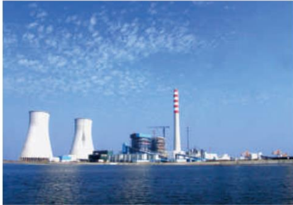
▼ Thermal Power Plant

Deefine cartridge filters are widely used in Seawater desalination, Reclamation Plant, Chemicals, Oil refinery, Coal Chemicals, Metallurgy and so on.