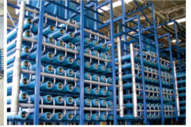
▲ Sea Water Desalination