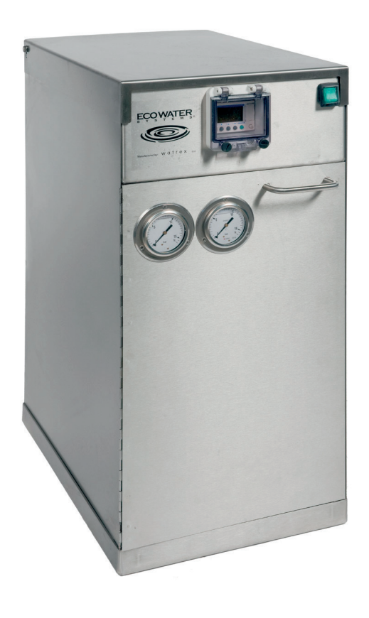
ROHD SB Reverse Osmosis High Demand Small Box Compact - Suitable where space is limited.