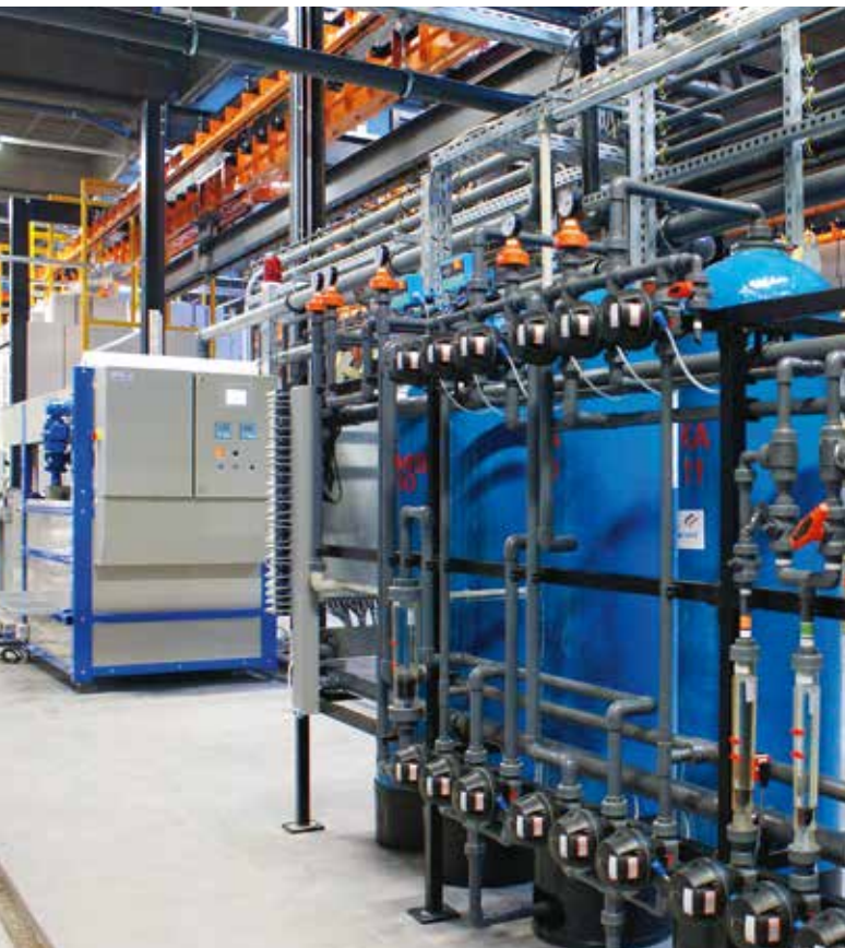
Decentralized, process-integrated wastewater treatment plant and water recycling for the automotive industry.