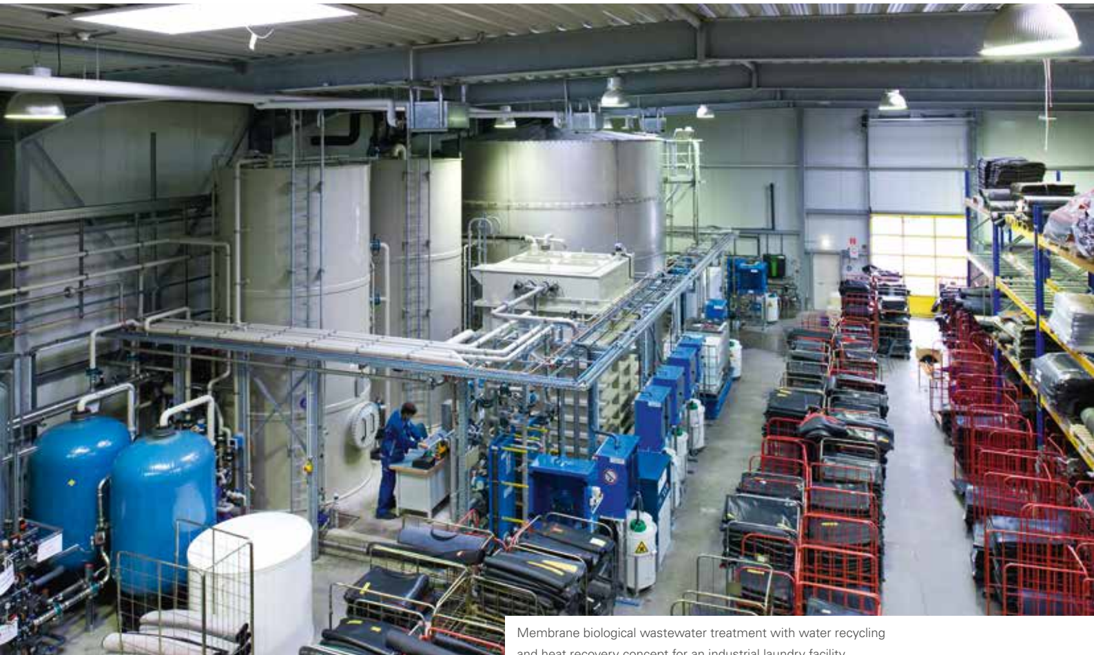
Membrane biological wastewater treatment with water recycling and heat recovery concept for an industrial laundry facility.

There are countless different types of industrial wastewater. In addition, the legal requirements for cleaned water differ significantly from country to country and sector to sector. As a result, the person responsible for wastewater treatment in a company always requires a tailored solution. And above all else, this solution must be efficient.