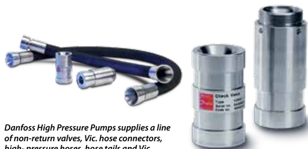
Danfoss High Pressure Pumps supplies a line of non-return valves, Vic. hose connectors, high-pressure hoses, hose tails and Vic. clamps in Duplex.

Capacity: Wide flow range that fits to our pump range.