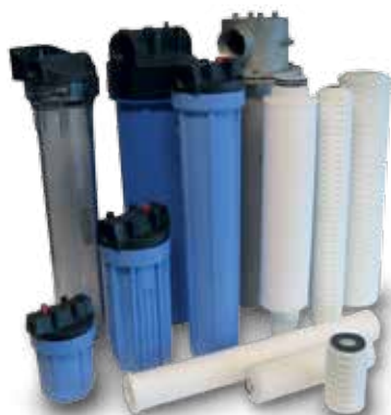
A wide range of filter housings and cartridges for pre-filtration is available.

It is recommended to use filters from the Danfoss filter product range.