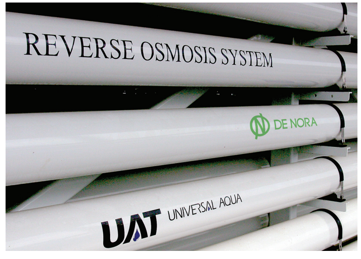
UAT<sup>™</sup> Reverse Osmosis Membrane Filtration System

De Nora is passionately committed to research and development of innovative technologies, reinvesting 3% of revenue into new product development each year. Our R&D team scouts for new innovations and creates new and improved products for the industries above, including municipal water and wastewater.