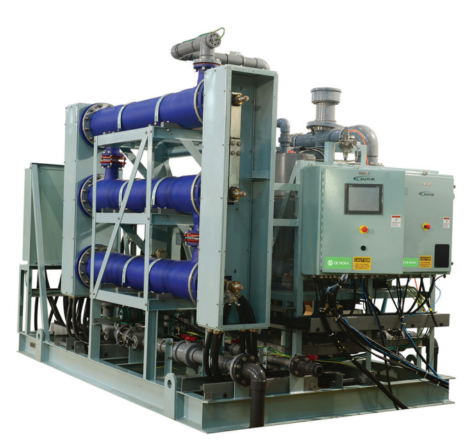
BALPURE<sup>®</sup> Ballast Water Treatment System Hybrid Configuration