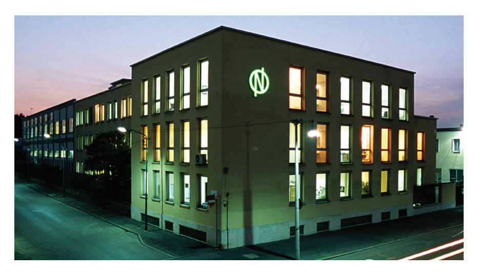
De Nora Headquarters - Milan, Italy