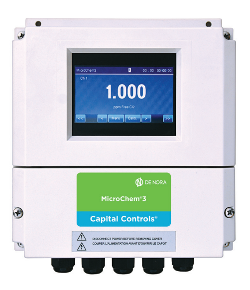
Capital Controls<sup>®</sup> MicroChem<sup>®</sup>3 Modular Water Analysis System

De Nora got right to work focusing on continuous innovation and development across product lines. The new Capital Controls® MicroChem®3 analyzer and controller was unveiled at ACE2017 in Philadelphia. The multi-parameter water analysis system offers both measurement and control of chlorine-based compounds and other critical elements in one versatile instrument that can be specifically tailored to individual applications.