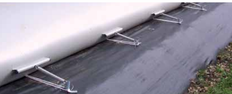
Through flexible anchorage, it is in the right position at every liquid level.

Albers Alligator delivers its products both nationally and internationally. Local dealer networks are used to make this possible. This means that there is always an expert nearby. The Bagtank is used in a large number of markets, such as industry, civil engineering and agriculture.