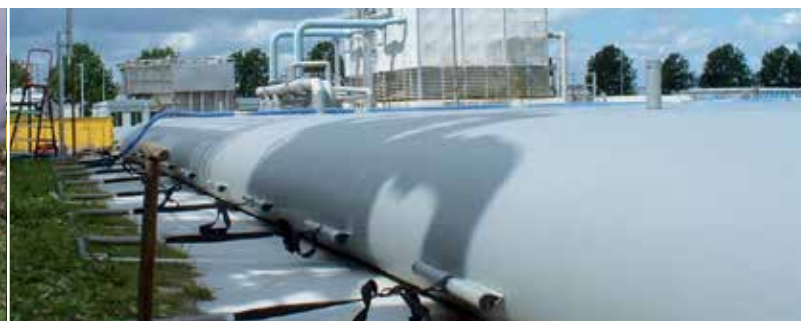
The Alligator Bagtank is suitable for industrial applications.