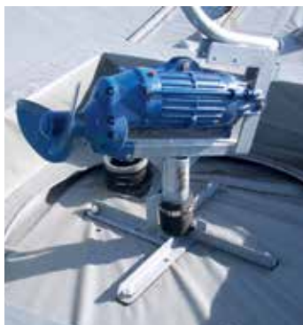
Mixer on mixerbase.