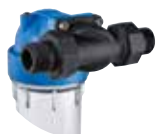
Plastic MP 3/4" and 1"