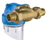
Brass MO 1"