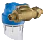
Brass MO 3/4"