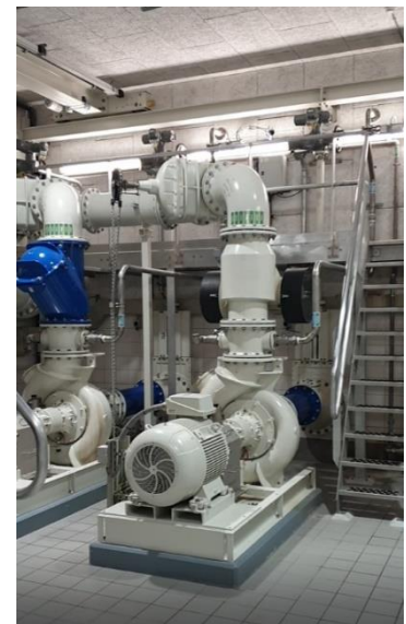
Lift station – pump cellar

In the old situation, the wastewater is sucked away through the suction nozzles towards the wastewater treatment plant. Because the