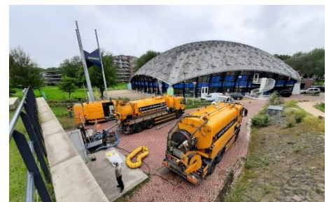
Lift station in The Hague during maintenance

The sewage pumping station regularly clogged due to