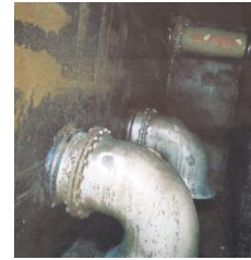
Old situation and new situation with ROLAPAC

By installing the ROLAPAC solution, wastewater is no longer only extracted via the low-mounted suction nozzles, but also via an extra opening at the top of the reception cellar. The ROLAPAC