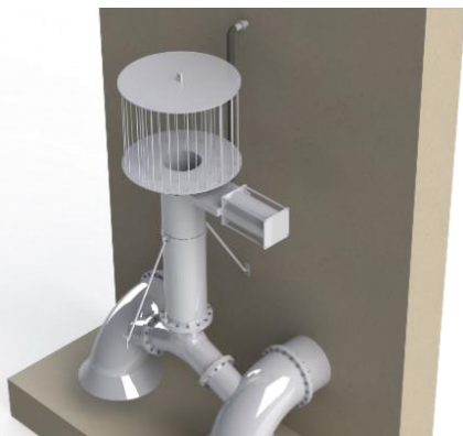
ROLAPAC - schematic

This pollution causes the pumps to become so polluted preventing it to pump the waste water. If this happens, the risk of overflow into surface water from sewage water is a major risk. This is harmful to the surface water because the oxygen content in the water drops causing environmental harm, like for example, fish mortality. Climate change also shows that more and more pressure is being exerted on the sewage system. This is why a cleaning is regularly carried out, however, is an expensive and