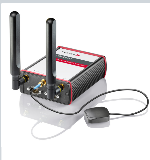
VN4610 Network Interface with GNSS receiver